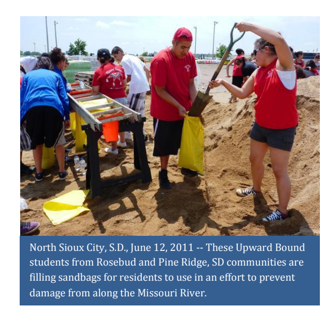
Figure 5: North Sioux City, S.D., June 12, 2011

Why this need? Emergency management resources, especially personnel, are apt to be stretched in future operating environments marked by tight budgets and/or more frequent national emergencies. In some cases, skill gaps may become more pronounced, and alternative staffing models will become important. How might we further