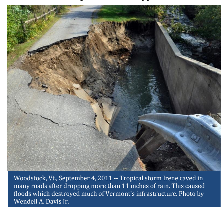
Figure 3. Woodstock, VT, September 4, 2011

Climate change can affect core emergency management mission areas and our longterm vision of reducing physical and