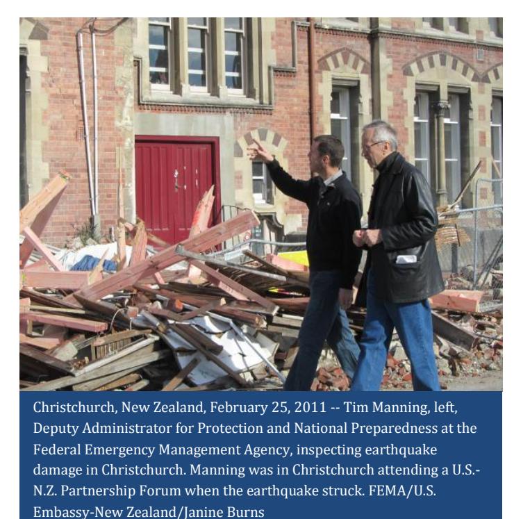
Figure 4: Christchurch, New Zealand, February 25, 2011

The environment in which we operate is increasingly defined by countervailing economic and political forces: continuing globalization, increasing interdependencies in governance institutions and business, and limited economic growth in the industrialized world that are constraining government budgets and creating resource limitations. In this environment, as businesses and governments rely on interlinked global supply chains, critical infrastructure in the U.S. is deteriorating, and the global balance of power is shifting toward "emerging markets." Compounding these drivers is the evolving terrorist threat: terrorist organizations continue to plot attacks while inciting and radicalizing small groups and individuals to target America, its interests, aspirations, and