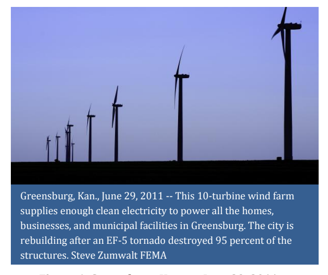
Figure 6: Greensburg, Kansas, June 29, 2011

Why this need? Future availability of important emergency supplies cannot be assured. Global and national supply chains, some of which have