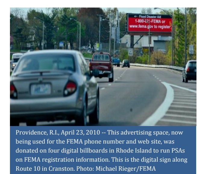
Figure 7: Providence, R.I., April 23, 2010

13. Proactively engage business in all emergency management phases and solicit its contribution to policy development, in light of the critical nature of private sector capabilities. We already engage the private sector in much of what we do. Moving forward, promoting further collaboration, cooperation, and appropriately close relationships between the private sector and the emergency management community will be vital. We will have to consider what legal and regulatory frameworks we will need in order to avoid conflicts of interest, since furthering our partnership with the private sector is a necessary element of serving the public in the future.